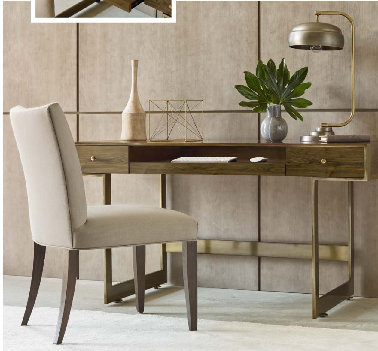
600-940 RISDEN DESK 600-636 BENTON SIDE CHAIR

OPPOSITE PAGE: 600-636 BENTON SIDE CHAIR 600-637 BENTON ARM CHAIR