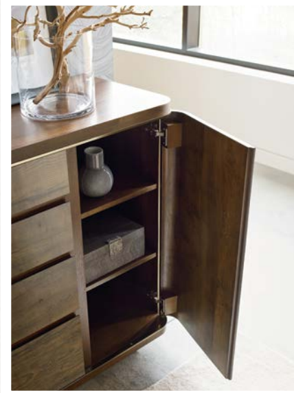
RIGHT: 600-131 SPENCER DRAWER/ DOOR DRESSER (inside detail)