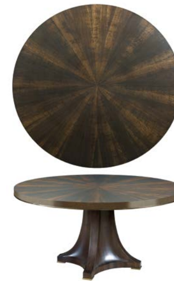
600-701R CAMBY ROUND PEDESTAL DINING TABLE Dia 60 H30 Consists of: -701 CAMBY ROUND PEDESTAL DINING TABLE-TOP Dia 60 H2-3/8 -B01 CAMBY ROUND PEDESTAL DINING TABLE-BASE Dia 32-7/16 H27-5/8 Adjustable levelers, metal burnished brass trim pages: 16/17