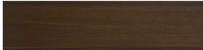
Fumed Quartered Oak Veneer