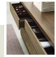
600-130 HOWARD DRAWER DRESSER (detail)