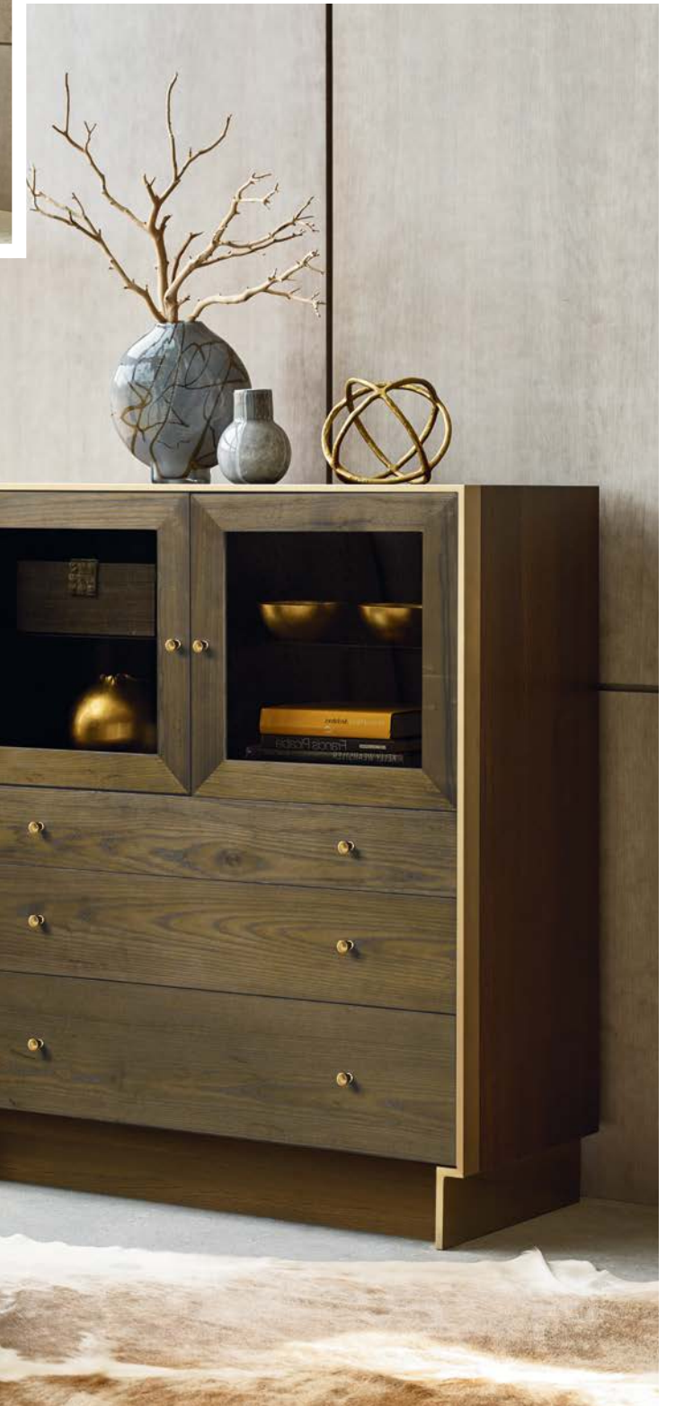
600-220 LAUREL BUNCHING CABINET

OPPOSITE PAGE: 600-215 FAULK FIVE DRAWER CHEST