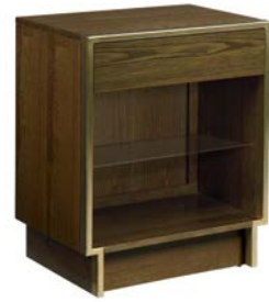
600-411 BERKLEY OPEN NIGHTSTAND W25 D18 H30 One drawer, lower shelf, recessed area in back behind drawer with two outlet plug and USB charging pages: 4, 13