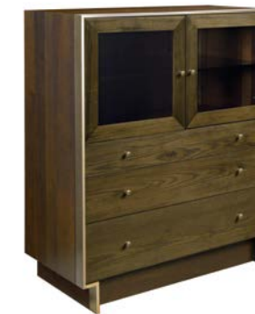
600-220 LAUREL BUNCHING CABINET