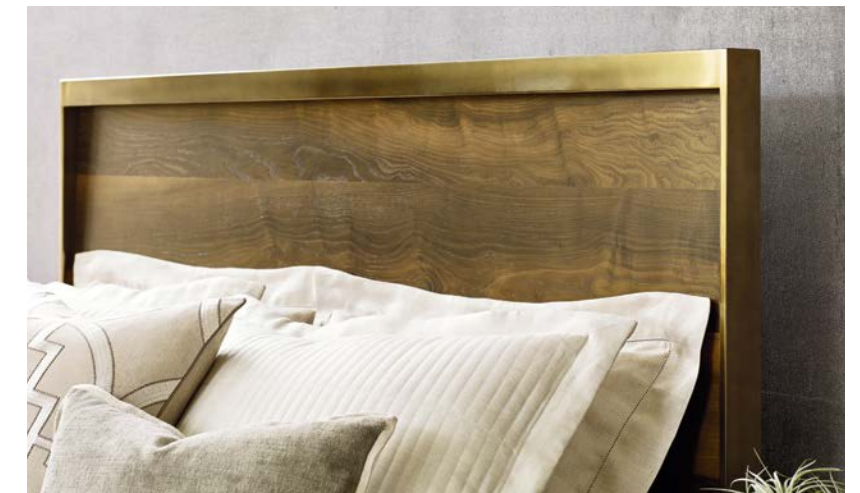
600-313 LUNA QUEEN PANEL BED HEADBOARD 5/0 (headboard light off)