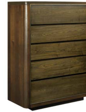
600-215 FAULK FIVE DRAWER CHEST