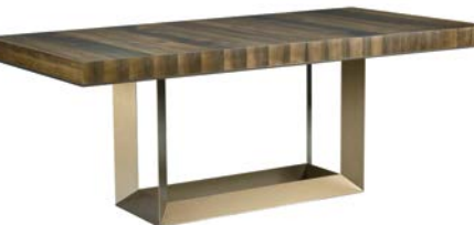
600-702R BANDON RECTANGULAR DINING TABLE W82 D42 H29½ Consists of: -702 BANDON RECTANGULAR DINING TABLE-TOP W82 D42 H3¾ -B02 BANDON RECTANGULAR DINING TABLE-BASE W44 D17¾ H25¾ Two 20 in leaves, extends to 122", adjustable levelers pages: 20/21, 24/25