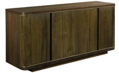
600-858 GILLIAM CREDENZA W72 D20 H34 Four doors, two interior drawers behind right side facing doors, one adjustable wood shelf behind left side facing doors, adjustable levelers, brown silverware insert in drawers, recessed area in back behind drawer with a three outlet plug and USB charging pages: 17, 18, 24