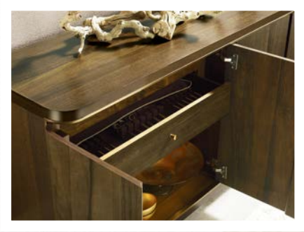
ABOVE: 600-858 GILLIAM CREDENZA (inside detail)