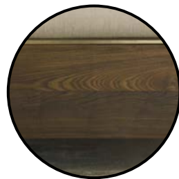
Color Tone Variations

Heavy flake (natural lighter tone grain) is one of the most desirable character markings that can be found in Oak. AD Modern seeks to include these characteristics. Due to the natural variations of this wood, heavy flake amounts will vary.