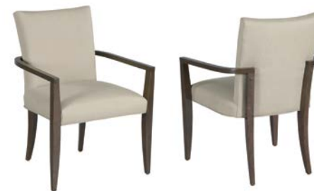
600-637 BENTON ARM CHAIR W24 D25 5/8 H36 Upholstered seat and back Seat Height: 19 Seat Depth: 19 Arm Height: 24-9/16 pages: 16/17, 20/21, 22/23