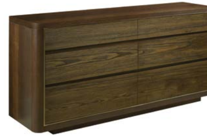
600-130 HOWARD DRAWER DRESSER