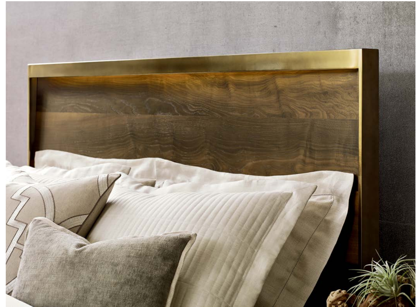
600-313 LUNA QUEEN PANEL BED HEADBOARD 5/0 (headboard light on)