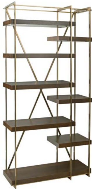
600-939 COWLEY ETAGERE W40 D17 H82 Eight wood shelves Shelf sizes (top to bottom) Shelf 1: W31 D14½ H6 Shelf 2: W17½ D14½ H5 Shelf 3: W31 D14½ H6 Shelf 4: W31 D14½ H11¾ Shelf 5: W17½ D14½ H5½ Shelf 6: W31 D14½ H8¾ Shelf 7: W17½ D14½ H7¾ Bottom Shelf: W31 D14½ H11-5/16 Burnished brass metal frame, fumed White Oak veneer shelves pages: 19, 25