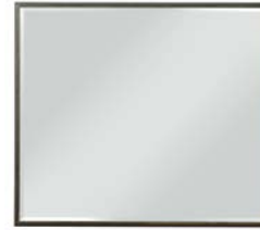
600-030 HOLT LANDSCAPE MIRROR

Natural wood color tone variations represent the natural variations between individual boards. Additionally, color variations among sap wood and heart wood which are exposed through the veneer fuming process, may occur within individual boards.