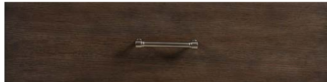
Dark Stained White Oak Veneer