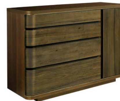
600-131 SPENCER DRAWER / DOOR DRESSER