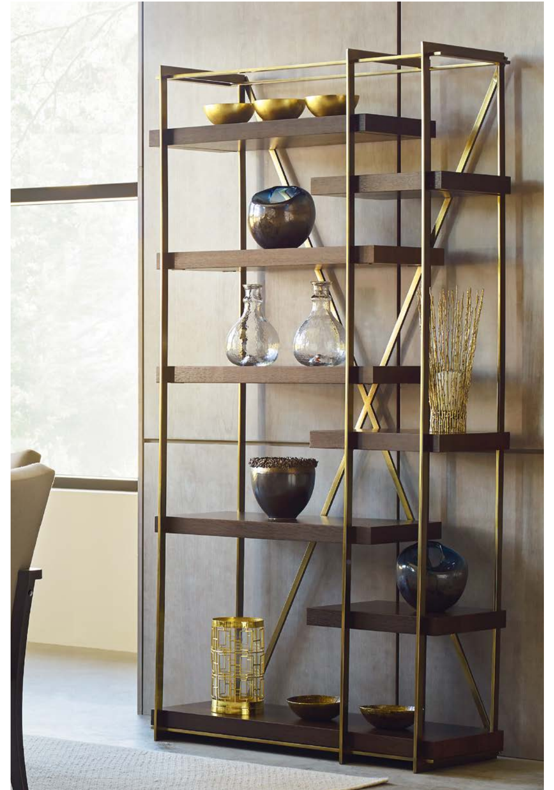
600-939 COWLEY ETAGERE