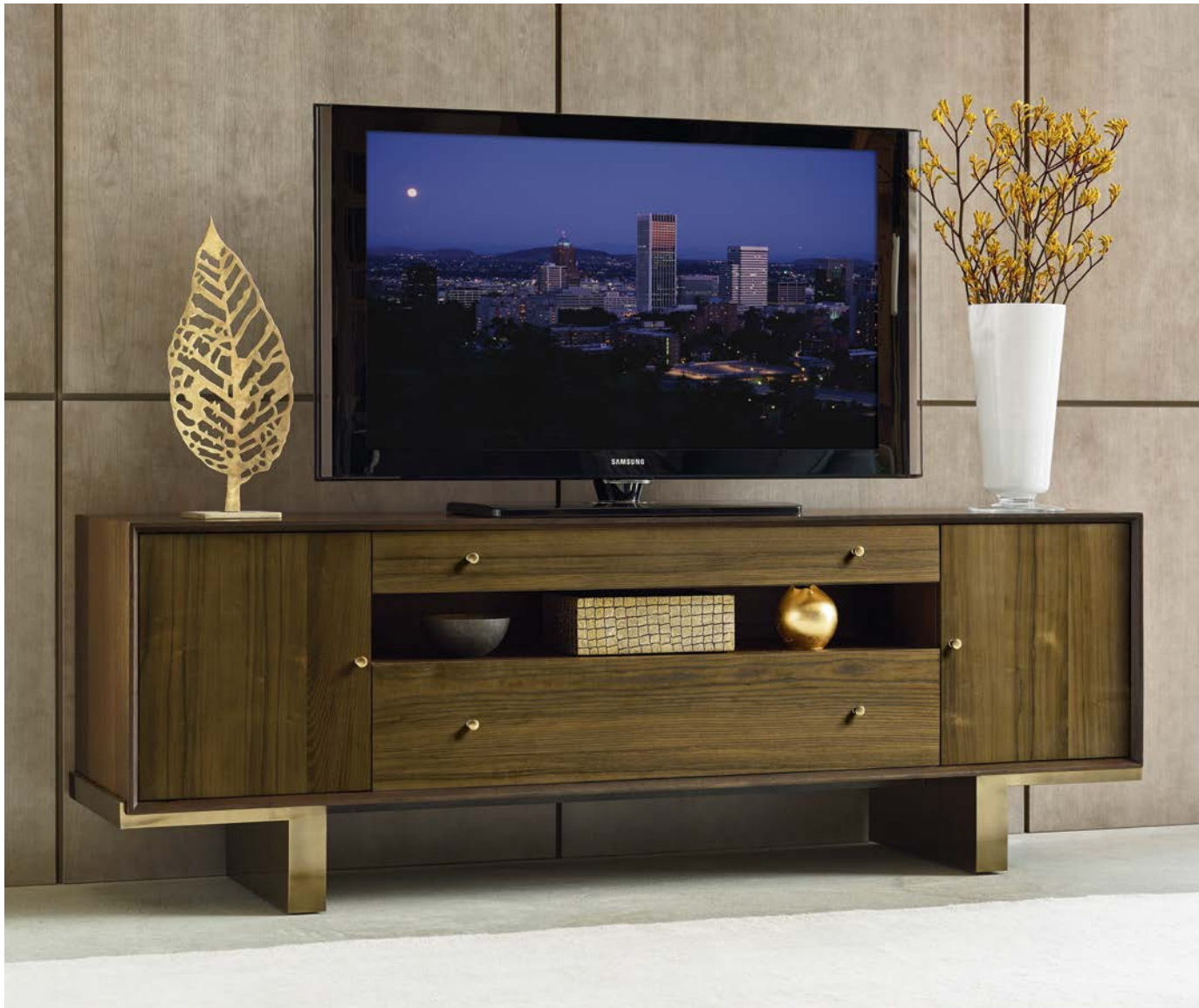
600-585 CONRAD ENTERTAINMENT CONSOLE

OPPOSITE PAGE: 600-918 WINKLER END TABLE