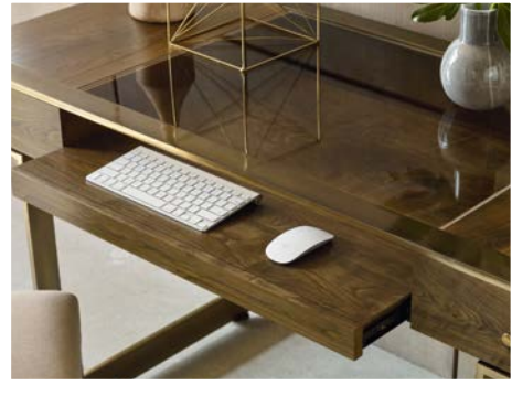
600-940 RISDEN DESK (pull out desk detail)