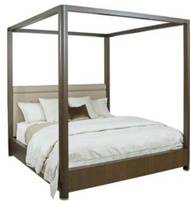
600-326R FREEMONT KING CANOPY BED 6/6 W88½ D88½ H90 Consists of: -326 FREEMONT CANOPY BED HEADBOARD 6/6 W84½ D3¼ H90 -327 FREEMONT CANOPY BED FOOTBOARD 6/6 W84½ D3¼ H90 -992 FREEMONT CANOPY BED FRAME 6/6 W84½ D88½ H90 -R53 BOLT ON RAILS W82 D3¼ H10¼ pages: 12/13, 14/15