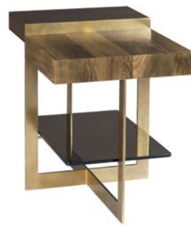
600-918 WINKLER END TABLE W28½ D20 H26½ Tempered bronze glass shelf in center, adjustable levelers, pages: 27, 29