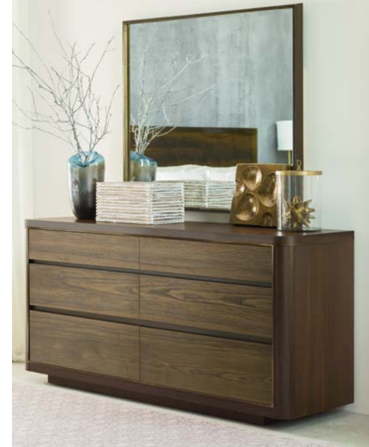
600-030 HOLT LANDSCAPE MIRROR 600-130 HOWARD DRAWER DRESSER