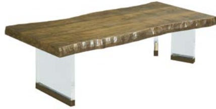
600-912 BREVARD LIVE EDGE COCKTAIL TABLE W53 D26¾ H17½ Fumed Olive Ash Veneers on live edge top, acrylic base, metal burnished brass trim pages: 32/33