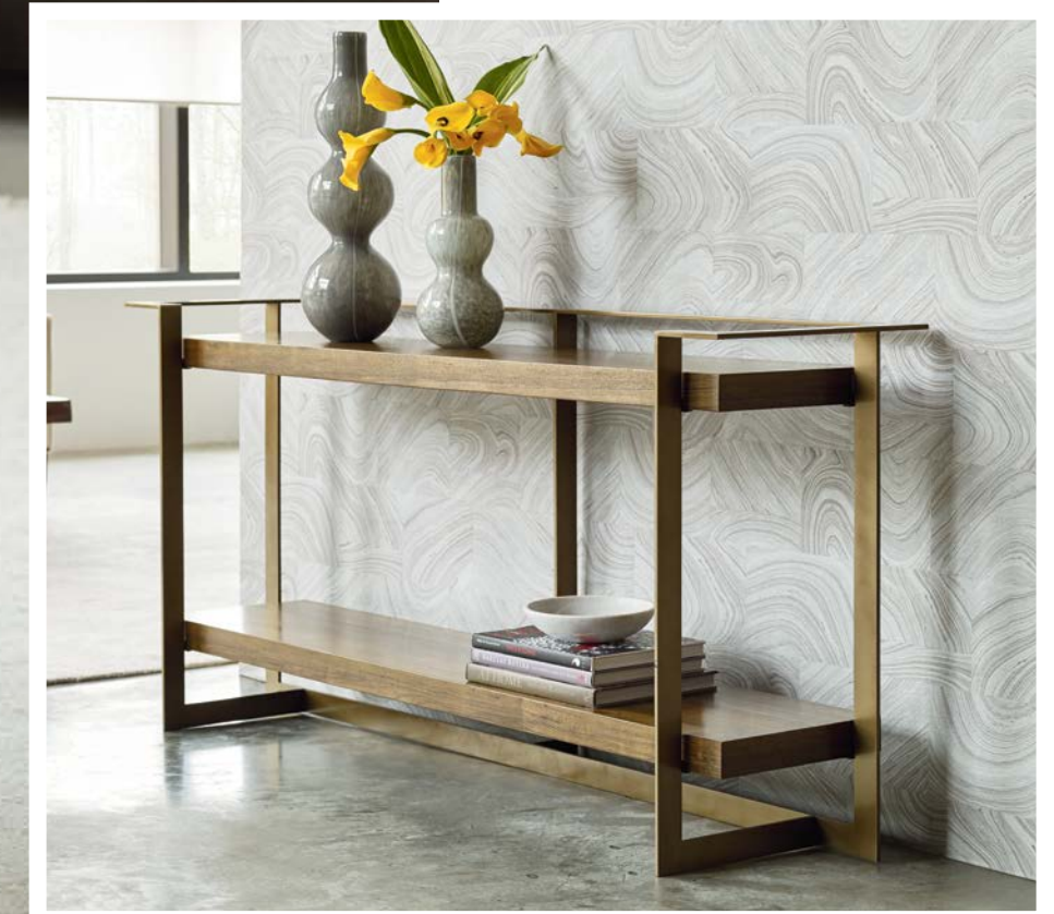
600-926 TIMOTHY CONSOLE TABLE