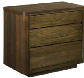
600-420 HAYS THREE DRAWER NIGHTSTAND W36 D19 H30 Three drawers, recessed area in back behind drawer with a two outlet plug and USB charging, Cedar lined bottom drawer, adjustable levelers pages: 6/7, 15