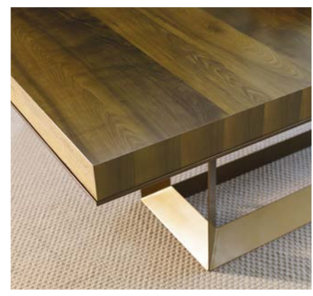
600-702R BANDON RECTANGULAR DINING TABLE (table top detail)