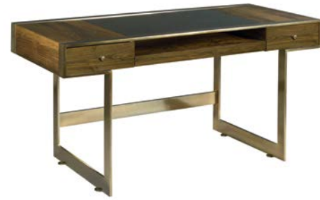
600-940 RISDEN DESK W58 D26 H30 Wood top, two drawers, tempered bronze glass in center above opening, adjustable levelers, removable pencil tray in drawers, pull-out shelf in center, opening size: W29-7/8 D24¾ H3, knee hole size: H24-3/8 pages: 22