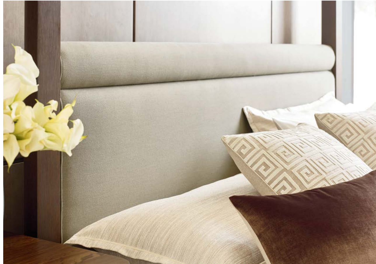
600-326 FREEMONT KING CANOPY BED HEADBOARD 6/6 (headboard detail)

OPPOSITE PAGE: 600-420 HAYS THREE DRAWER NIGHTSTAND