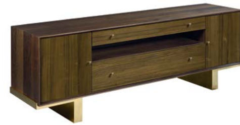
600-585 CONRAD ENTERTAINMENT CONSOLE W78 D19 H27 Two drawers, two doors, two adjustable shelves, cord exits, component opening, recessed area in back behind door with a three outlet plug, adjustable levelers, adjustable shelf behind doors - shelf size: W15¼ D16, opening in center: W44 D15 H5, area behind doors without shelf: W15½ D16-11/16 H18 pages: 26/27, 28