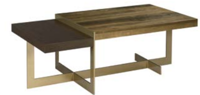
600-910 OGDEN RECTANGULAR COCKTAIL TABLE W52 D28 H19 Wood top, adjustable levelers pages: 26/27, 30/31