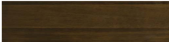
Fumed Quartered Oak Veneer (case sides)