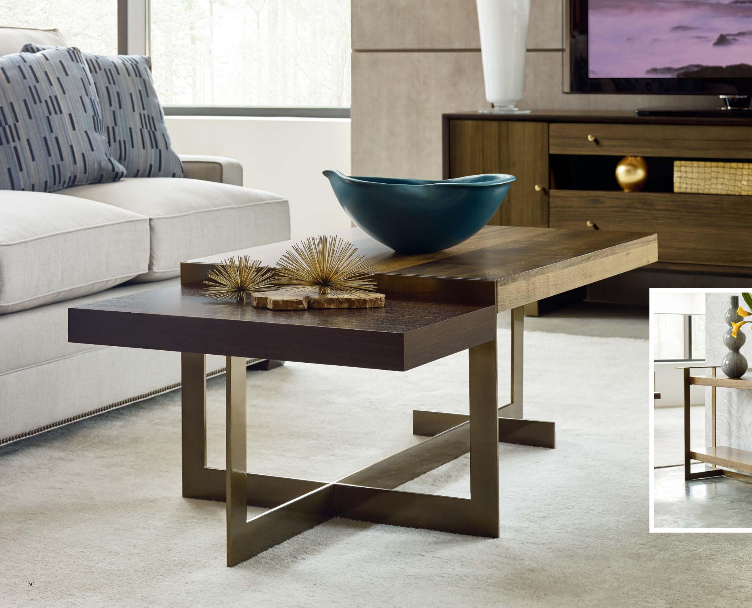
600-910 OGDEN RECTANGULAR COCKTAIL TABLE