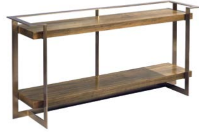
600-926 TIMOTHY CONSOLE TABLE W62 D16 H30 Wood shelf in center, adjustable levelers, pages: 31, 33