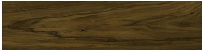
Fumed Olive Ash Veneers