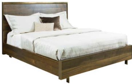
600-317R LUNA CAL KING PANEL BED 6/0 W87 D91 H54 Consists of: -316 LUNA PANEL BED HEADBOARD 6/6 W81 D2½ H54 LED light strip in top of headboard -317 LUNA PANEL BED FOOTBOARD 6/6 W81 D2½ H16¼ -R44 BOLT ON RAILS 6/0 W86 D3-3/8 H10