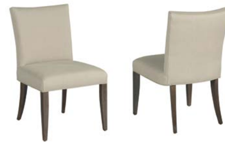
600-636 BENTON SIDE CHAIR W21¾ D25-9/16 H36 Upholstered seat and back Seat Height: 19 Seat Depth: 19 pages: 16/17, 20/21, 22/23