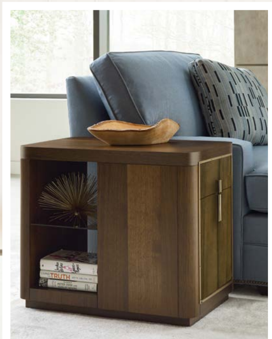
600-915 KERN DRAWER END TABLE