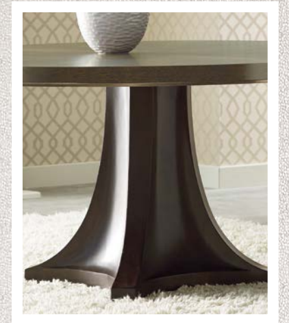
600-701 CAMBY ROUND PEDESTAL DINING TABLE-BASE (base detail)