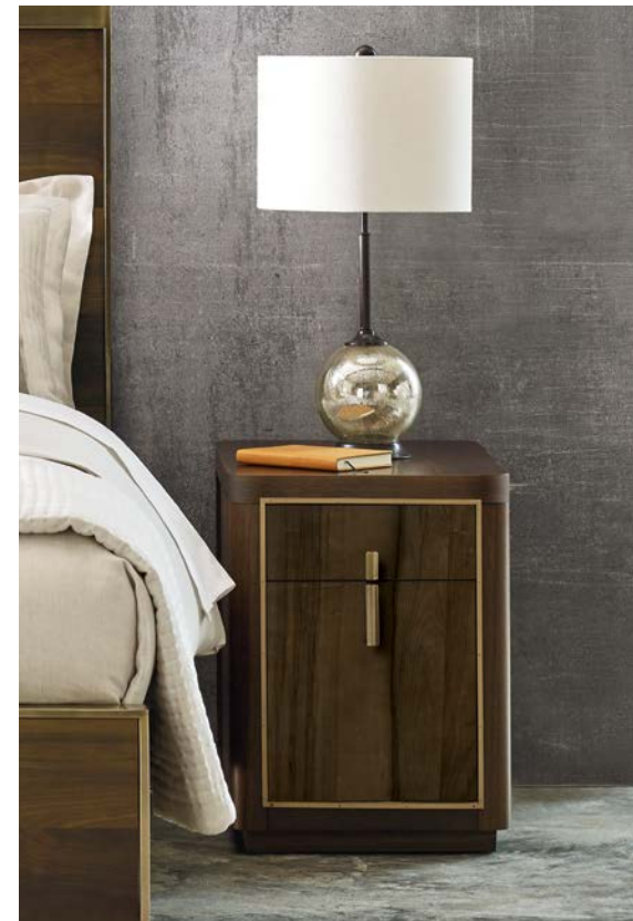
600-915 KERN DRAWER END TABLE