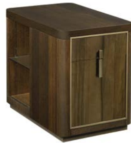
600-915 KERN DRAWER END TABLE W18 D28 H24 Two drawers, file storage, open area size: H11 D68½ H18-7/8 pages: 7, 16