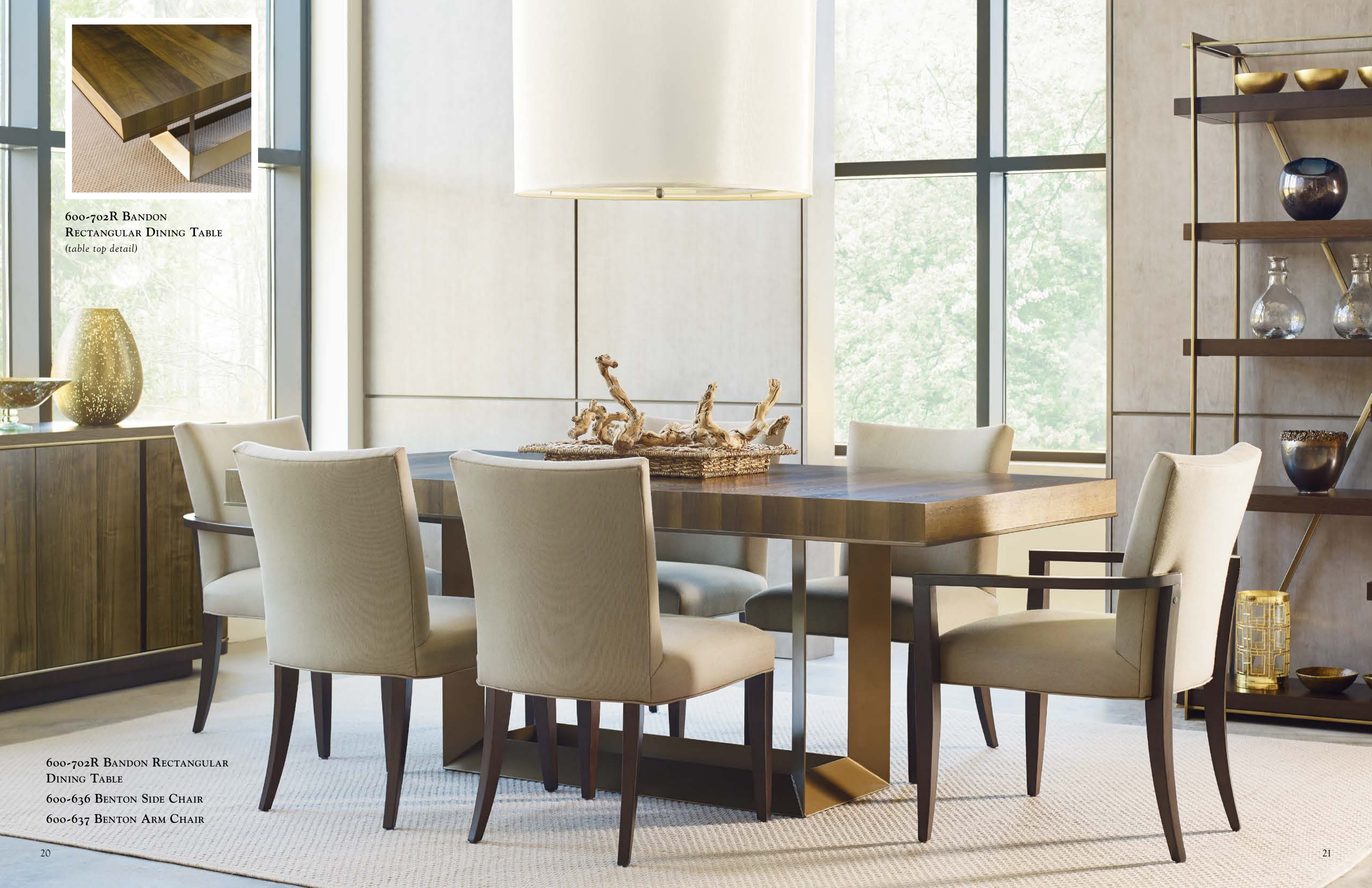
600-702R BANDON RECTANGULAR DINING TABLE