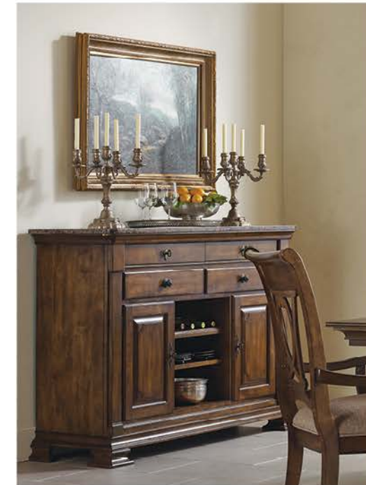
95-090M Portolone Sideboard with Marble Top