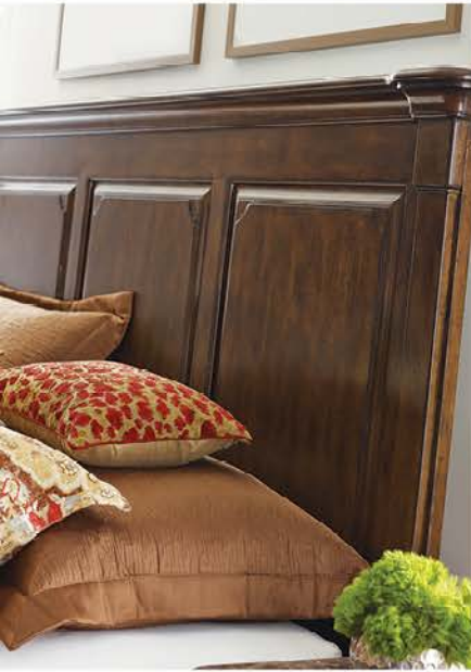
95-131H Monteri Panel Bed Headboard - King