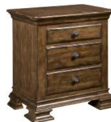
95-141 Nightstand W28 D18 H30 in Three drawers, adjustable levelers Page 5