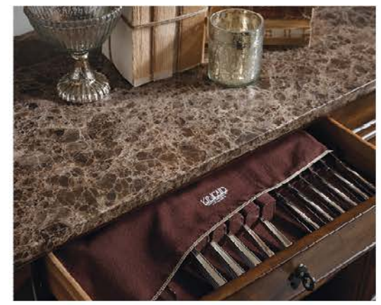
95-090M Portolone Sideboard with Marble Top (marble and silverware drawer detail)