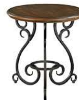
95-020 Accent Table W24 D24 H25-7/8 in Wood top, metal base Page 25