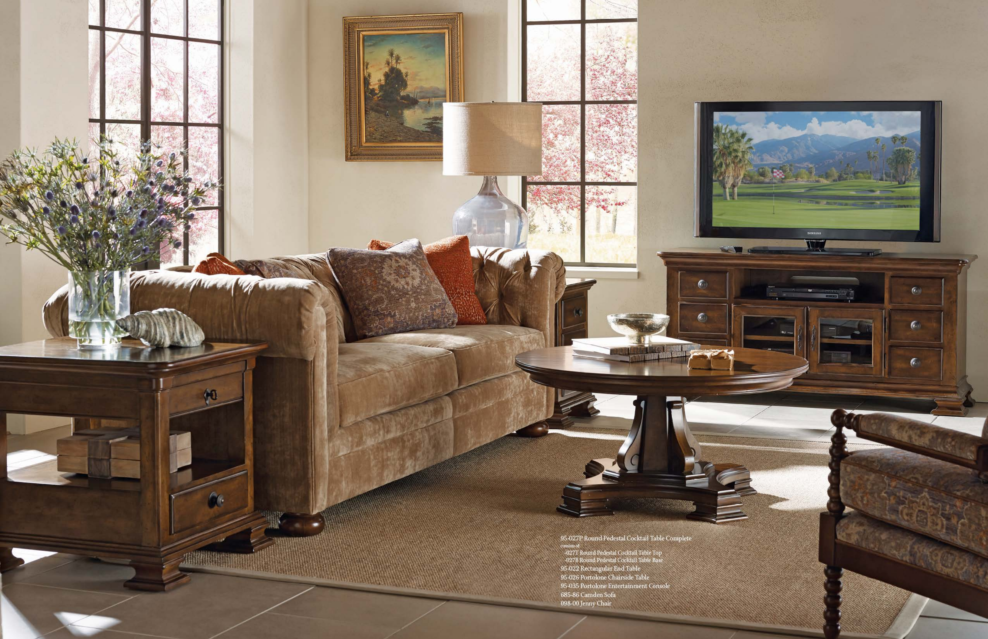
95-027P Round Pedestal Cocktail Table Complete consists of: -027T Round Pedestal Cocktail Table Top -027B Round Pedestal Cocktail Table Base 95-022 Rectangular End Table 95-026 Portolone Chairside Table 95-035 Portolone Entertainment Console 685-86 Camden Sofa 098-00 Jenny Chair