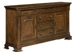
95-084 Portolone Credenza W72 D19 H38 in Two doors, five drawers, silverware tray, two adjustable shelves, adjustable levelers. Pages 14, 17