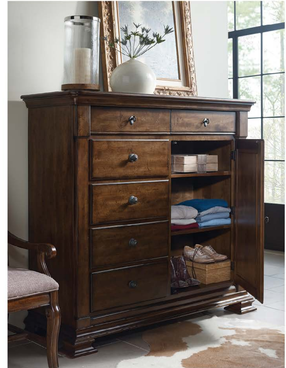
95-162 Door Chest (open detail)