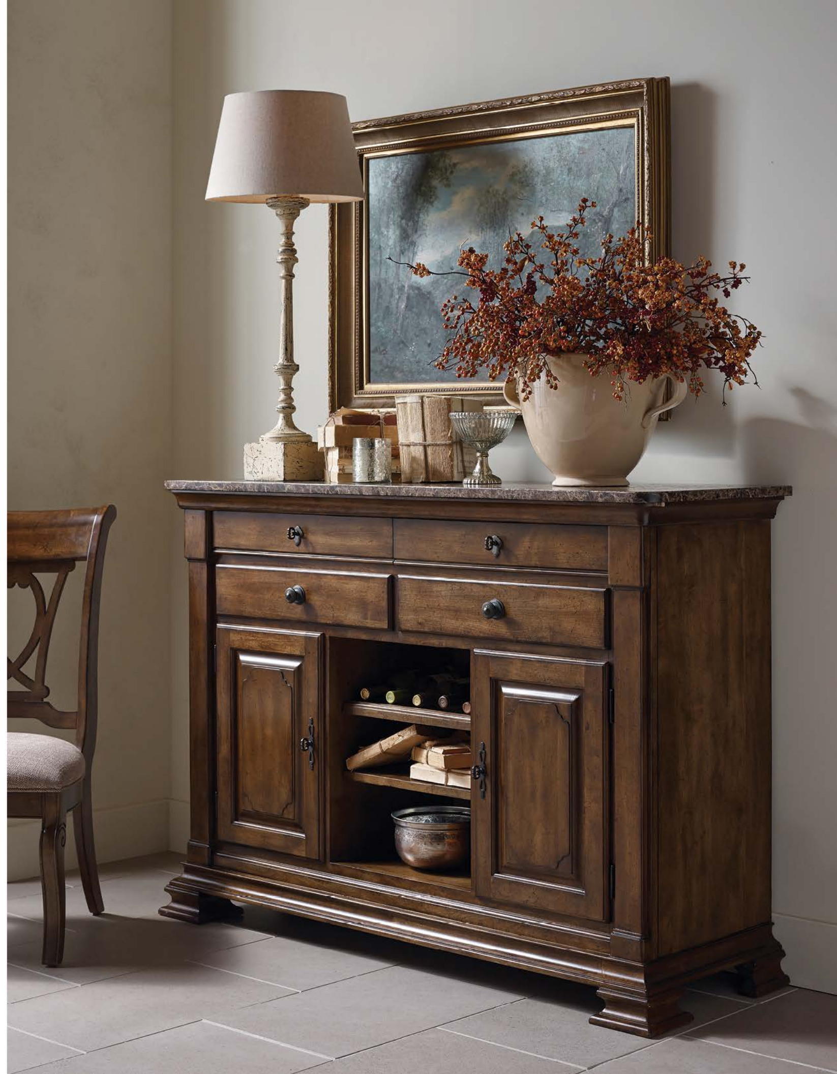
Opposite Page | 95-090M Portolone Sideboard with Marble Top

Portolone offers room for everyone at the table with three unique dining options with seating for up to eight, 72 inch round dining table, and classic conveniences like a Lazy Susan and sideboard bakers rack