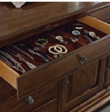
95-160 Basilica Door Dresser (jewelry drawer detail)