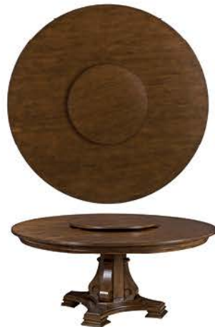
95-053P 72" Stellia Pedestal Table W72 D72 H30 in consists of: -052B Stellia Pedestal Table - Base W38-3/4 D38-3/4 H27 in -053T Stellia Pedestal Table - Top W72 D72 H3 in Adjustable levelers, includes 32" diameter Lazy Susan

Table Sizes: W60 D60 H30 in Pages 20, 21