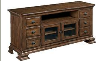
95-035 Portolone Entertainment Console W60 D19 H29 in Six drawers, two doors, adjustable shelf, cord exits, vent slots, component opening, electrical outlet, adjustable levelers Top center opening: W 28-15/16 x D 16-13/16 x H 6in Space behind glass doors: W 28-15/16 x D 16-1/2 x H 12-1/2 in Pages 27, 31