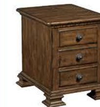
95-026 Portolone Chairside Table W20 D26 H25 in Three drawers, flip top with electrical outlet Page 25, 26, 27, 29, 31