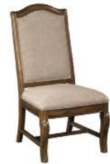
95-063 Upholstered Back Side Chair W21-1/2 D25-3/4 H43-5/8 in Upholstered seat and back Seat fabric shown: Sandstone Seat height: 19 in Seat depth: 18-3/4 in Pages 18, 19, 20, 21