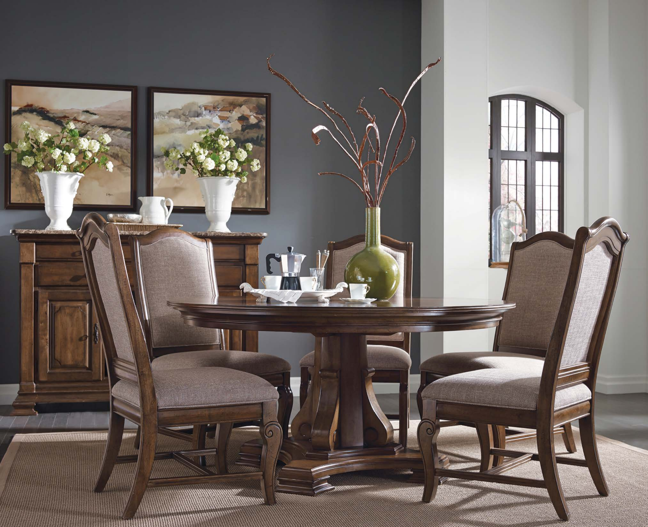
95-052P 60" Stella Pedestal Dining Table Complete W60 D60 H27 in consists of: -052B Stella Pedestal Dining Table - Base -052T Stella Pedestal Round Dining Table - Top 95-090M Portolone Sideboard with Marble Top 95-063 Upholstered Back Side Chair