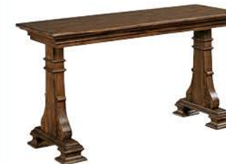
95-025 Sofa Table W54 D18 H30 in Page 23