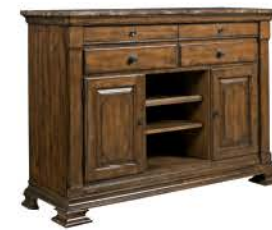
95-090M Portolone Sideboard with Marble Top W62 D21 H44-1/8 in Two doors, four drawers, four adjustable shelves, one shelf holds wine bottles, adjustable levelers Pages 1, 13, 15, 16, 18, 20, 21