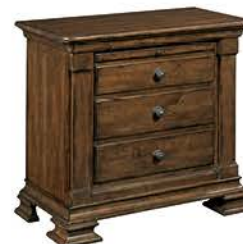
95-142 Bachelor's Chest W34 D18 H32 in Wood top, three drawers, adjustable levelers, pull-out shelf Pages 9, 10