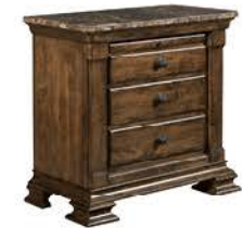
95-142M Bachelor's Chest with Marble Top W34 D18 H32 in Marble top, Three drawers, adjustable levelers, pull-out shelf Page 11