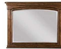
95-114 Landscape Mirror Beveled Mirror W50 D3-3/4 H38 in Page 8