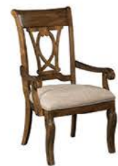
95-062 Harp Back Arm Chair W25 D27 H42-3/8 in Upholstered seat, Seat fabric shown: Sandstone Seat height: 19-1/2 in Seat depth: 18-3/4 in Arm height: 24-7/8 in Pages 14, 15, 16, 17