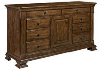
95-160 Basilica Door Dresser W68 D21 H38-1/8 in Eight drawers, one door, adjustable shelf, jewelry tray in top right drawer, adjustable levelers Page 8