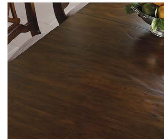
95-054T Portolone Trestle Table Top (skiving finish detail)