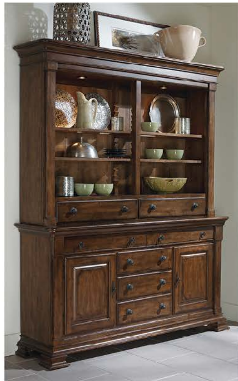
Left: 95-088P Portolone Hutch & Credenza Complete consists of: -084 Portolone Credenza -088 Portolone Hutch