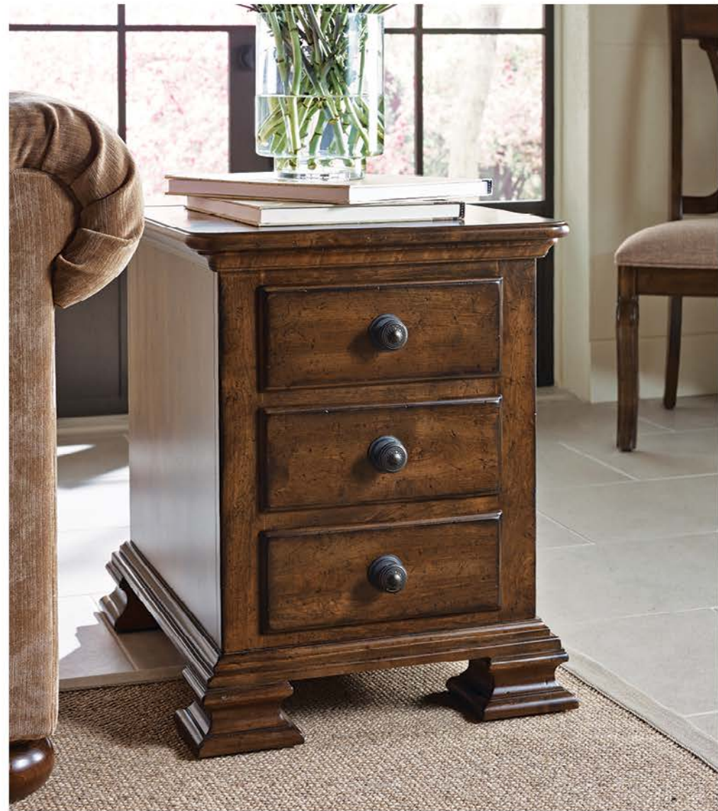
95-026 Portolone Chairside Table