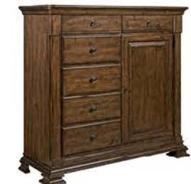
95-162 Door Chest W58 D21 H55-1/8 in Six drawers, one door, closet rod, two adjustable shelves, adjustable levelers Pages 6, 7