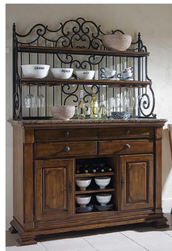
95-091 Baker's Rack 95-090M Portolone Sideboard with Marble Top