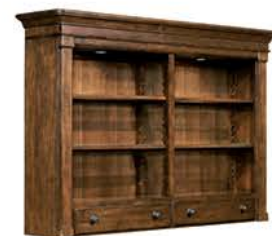
95-088 Portolone Hutch W73 D16 H50 in Two drawers, four adjustable shelves, touch lighting Pages 14, 17