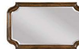
95-118 Bureau Mirror Beveled Mirror W50 D2 H30 in Pages 4, 5