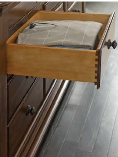
95-160 Basilica Door Dresser (drawer detail)