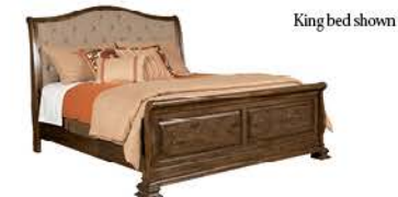
95-150P Portolone Sleigh Bed 5/0 W62-7/8 D97-3/8 H64-1/8 in

consists of: -131H Monteri Panel Bed Headboard 6/0-6/6 W84-5/8 D4-1/4 H65 in -131F Monteri Panel Bed Footboard 6/0-6/6 W84-5/8 D4-1/2 H26 in -306 Bolt On Bed Rail (6/0) 9" 00-830 Center Support