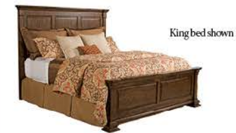
95-130P Monteri Panel Bed 5/0 W67-1/2 D88-3/4 H65 in

consists of: 95-130H Monteri Panel Bed Headboard 4/6-5/0 W67-1/2 D4-1/4 H65 in 95-130F Monteri Panel Bed Footboard 4/6-5/0 W67-1/2 D4-1/2 H26 in 95-300 Bolt On Bed Rail (5/0-6/6) 8" 00-830 Center Support