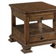
95-022 Rectangular End Table W25 D28 H25 in Two drawers, adjustable levelers Pages 24, 26, 28, 30