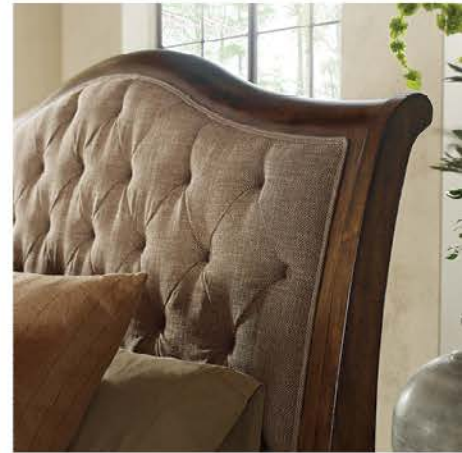
95-152H Portolone Sleigh Bed Headboard - King (detail)