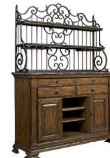
Sideboard & Baker's Rack Assembled Size: W62 D21 H82-3/8 in