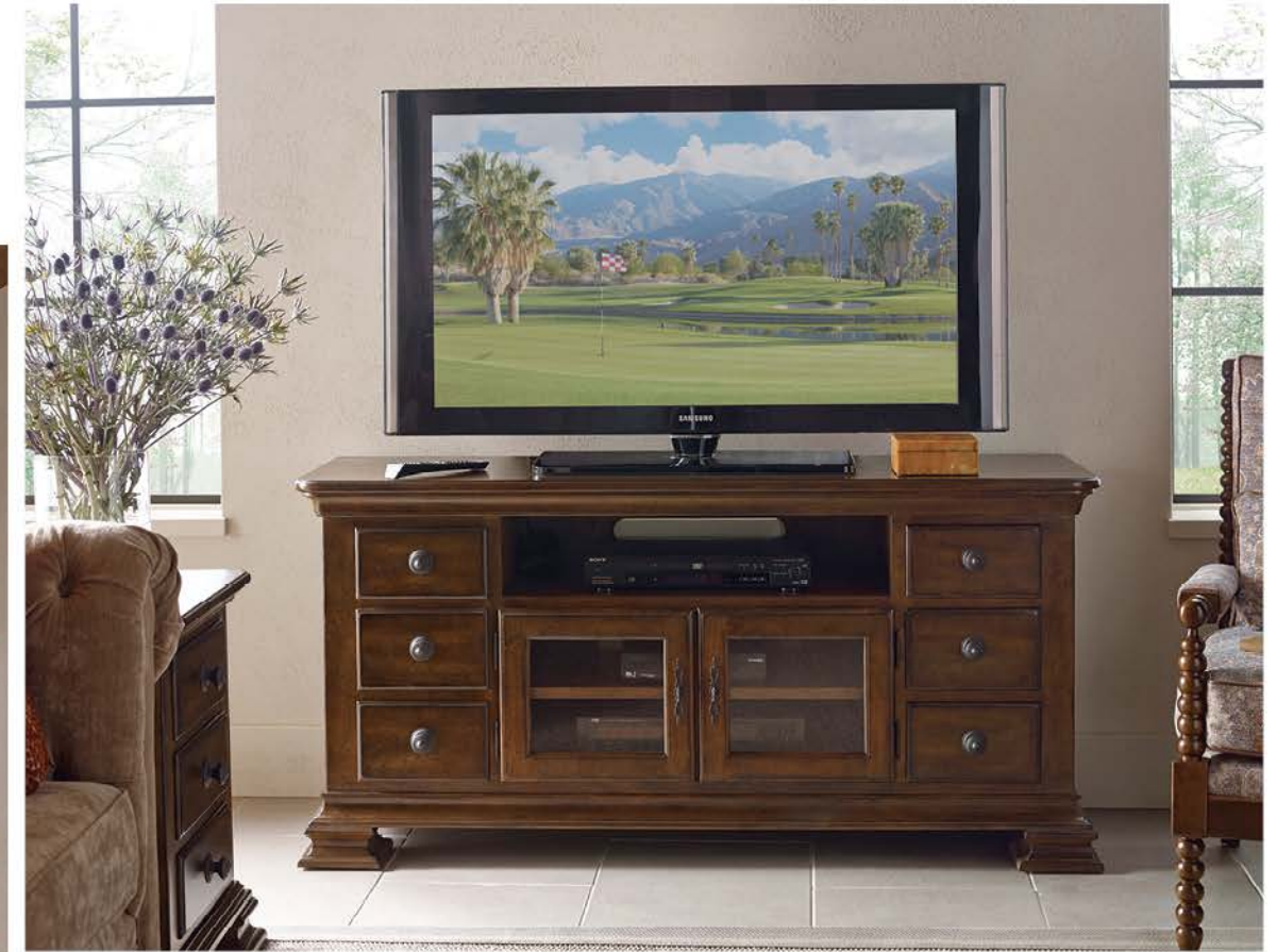
95-035 Portolone Entertainment Console