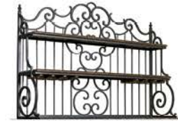
95-091 Baker's Rack W57-1/2 D13-7/8 H38-1/4 in Wine glass holders, two shelves Top shelf size: W59 x D5-5/8 Middle shelf size: W59 x D11-5/8 Pages 18, 21