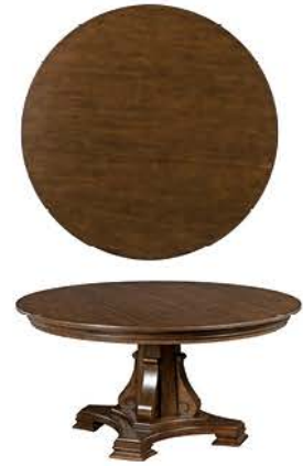
95-052P 60" Stellia Pedestal Table W60 D60 H30 in consists of: -052B Stellia Pedestal Table - Base W38-3/4 D38-3/4 H27 in -052T Stellia Pedestal Table - Top W60 D60 H3 in Adjustable levelers

Table Sizes: W60 D60 H30 in Pages 20, 21