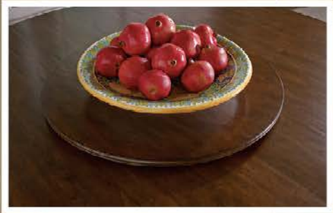
95-053T Stellia Pedestal Table Top (lazy Susan detail)

95-053P 72" Stellia Pedestal Table Complete consists of: -052B Stellia Pedestal Dining Table - Base -053T Stellia Pedestal Dining Table - Top 95-091 Baker's Rack 95-090M Portolone Sideboard with Marble Top 95-063 Upholstered Back Side Chair 95-064 Upholstered Back Arm Chair