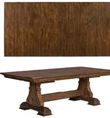
95-054P Portolone Trestle Table W88 D44 H30 in

Table Sizes: W72 D72 H30 in Pages 18, 19