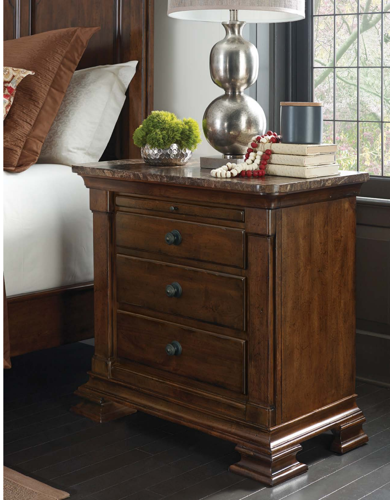
Opposite Page | 95-142M Bachelor's Chest with Marble Top