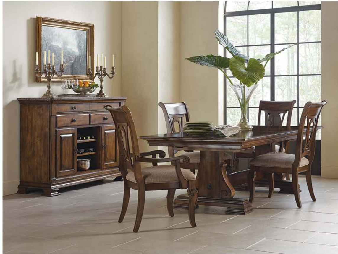
95-054P Portolone Trestle Table Complete, 95-061 Harp Back Side Chair, 95-062 Harp Back Arm Chair 95-090M Portolone Sideboard