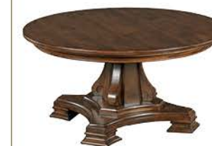
95-027P Round Pedestal Cocktail Table W40 D40 H20 in consists of: -027T Round Pedestal Cocktail Table Top -027B Round Pedestal Cocktail Table Base Page 26, 31