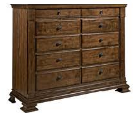
95-161 Portolone Bureau W62 D21 H48 in Ten drawers, adjustable levelers Page 5