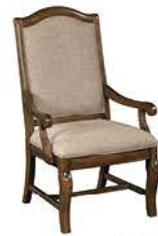
95-064 Upholstered Back Arm Chair W25-1/8 D25-3/4 H43-5/8 in Upholstered seat and back Seat fabric shown: Sandstone Seat height: 19 in Seat depth: 18-3/4 in Arm height: 24 in Pages 18, 19