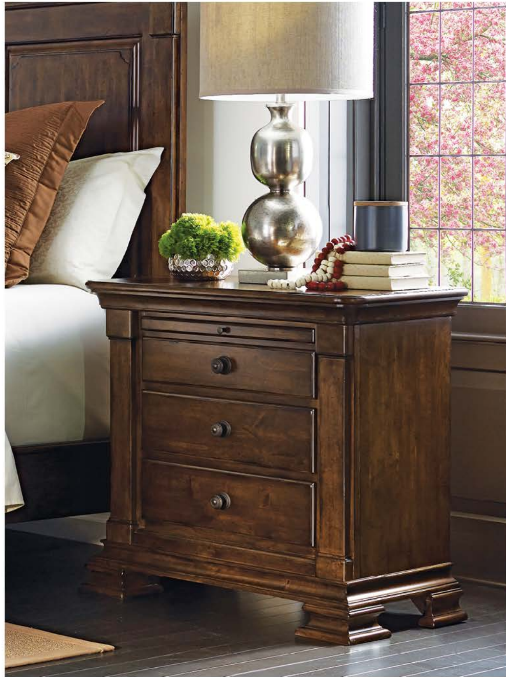
95-142 Bachelor's Chest