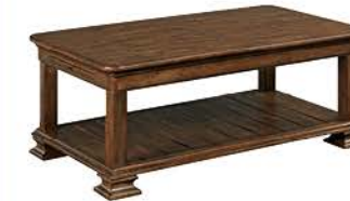
95-023 Rectangular Cocktail Table W50 D28 H20 in Two pull-out shelves, one lower shelf Pages 24, 25