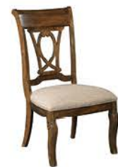
95-061 Harp Back Side Chair W22 D27 H42-3/8 in Upholstered seat, Seat fabric shown: Sandstone Seat height: 19-1/2 in Seat depth: 18-3/4 in Pages 14, 15, 16, 17

Table Sizes: W88 D44 H30 in (with no leaves) W108 D44 H30 in (with one leaf) W128 D44 H30 in (with two leaves) Pages 14, 15, 16, 17