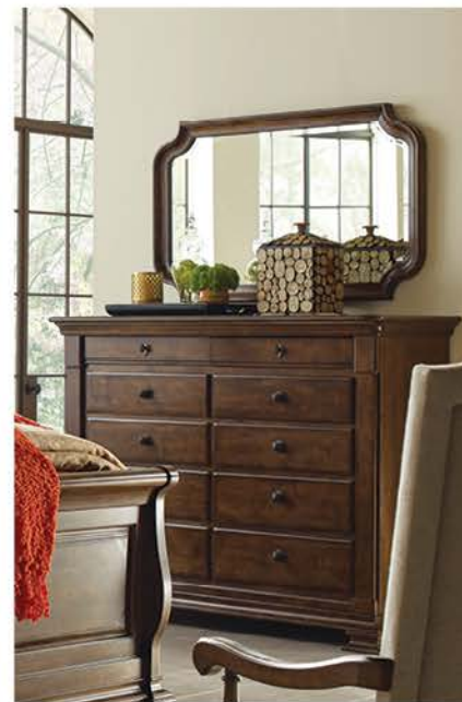
95-161 Portolone Bureau