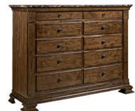
95-161M Portolone Bureau with Marble Top W62 D21 H48 in Ten drawers, adjustable levelers Page 4