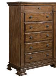
95-105 Portolone Drawer Chest W40 D21 H56-1/8 in Six drawers, drawer dividers in second and third drawers from top, adjustable levelers Page 3

consists of: -152H Portolone Sleigh Bed Headboard 6/0-6/6 W79-7/8 D12 H64-1/8 in -152F Portolone Sleigh Footboard 6/0-6/6 W79-7/8 D6-3/8 H30 in -153 Bolt On Sleigh Bed Rails (6/0) 9" 00-830 Center Support recommended