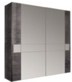
2/D SLIDING WARDROBE

Inner size inch 71" x 80" - cm 180,5 x 200,5 inch W 84" D 85" H 49" cm L 213 P 215,3 H 123,8 Crts 3 kg 102 m 3 0,36