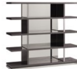
BOOKCASE PJHE0631 With drawer inch W 63" D 15" H 56" cm L 160 P 38 H 143,3 Crts 2 kg 144 m 3 0,69

With vanilla elm structure, seat and back in ecoleather inch W 20" D 24" H 43" cm L 50 P 60 H 108 Crts 1 kg 10 m 3 0,40