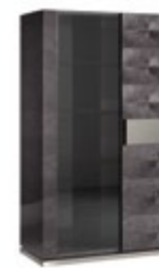
2/D CURIO PJHE600 With glass doors

inch W 25" D 21" H 75" cm L 64,5 P 52,7 H 190,4 Crts 2 kg 98 m 3 0,83