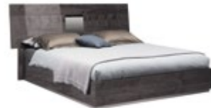
Q.S./UK 5" BED PJHE0150

inch W 64" D 18" H 18" cm L 162 P 45 H 45 Crts 1 kg 40 m 3 0,44