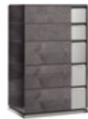
5/DRW. CHEST KJHE115 With 5 drawers

With 2 drawer inch W 26" D 19" H 20" cm L 65,6 P 47,7 H 51,4 Crts 1 kg 36 m 3 0,22