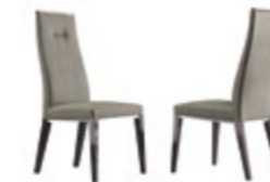
2 CHAIRS KJHE620 2 CHAIRS (UK FIRE RETARDANT) KJHE6201

inch W 52" D 1" H 38" cm L 132 P 2,2 H 96 Crts 1 kg 26 m 3 0,14