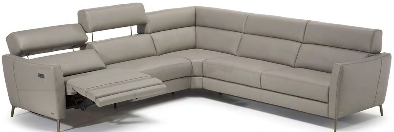
■ Vers. F50+F38+011+019