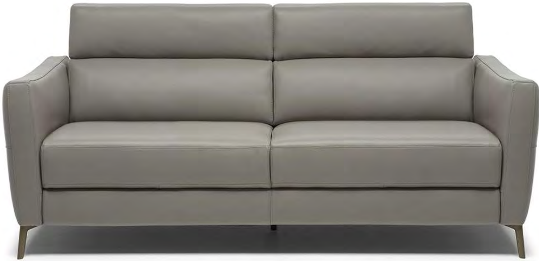
■ Vers. 009