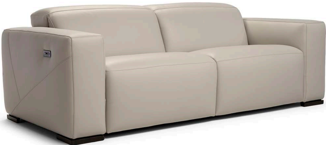
■ Vers. F46