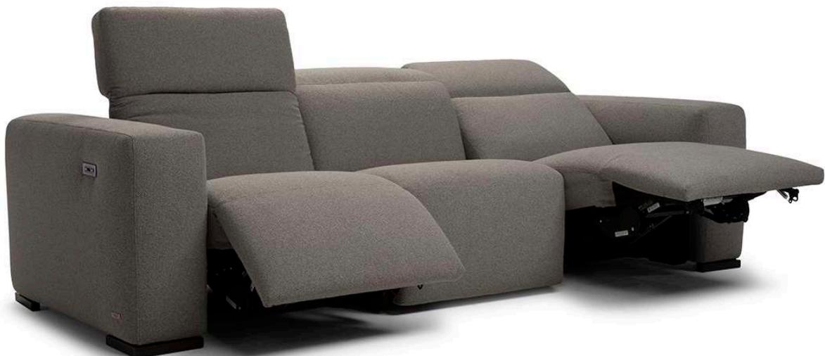
■ Vers. F00+001+F02