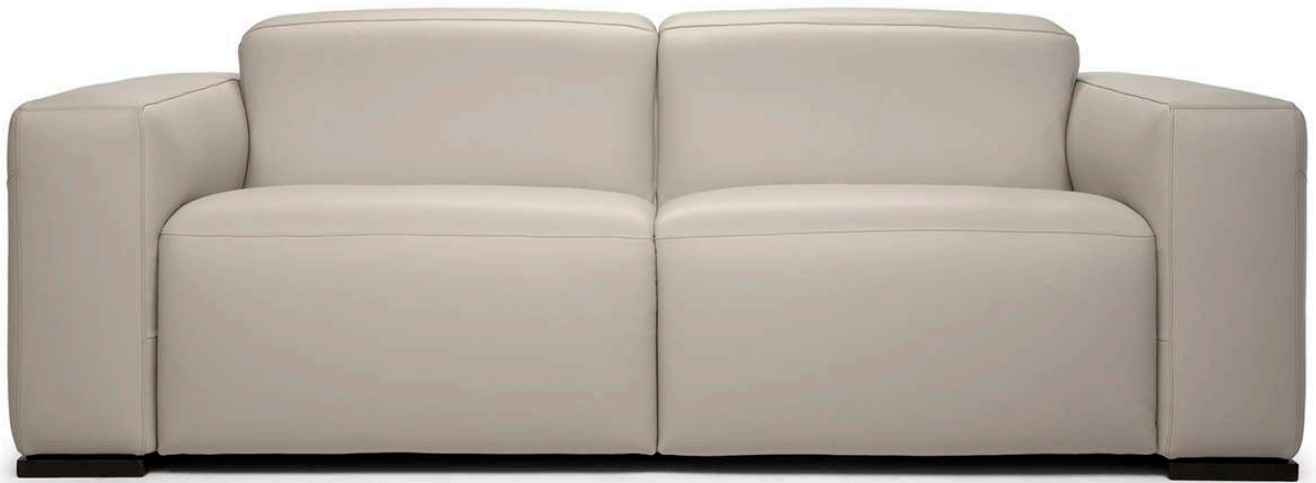
■ Vers. F46